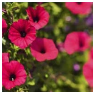
Wave petunias grow in clumps, providing colorful garden bed coverage.

Wave petunias grow in large clumps. They self-seed and spread throughout garden beds or window boxes quickly. However, these hardy self-propagating annuals still require some care and attention to thrive. You must deadhead wave petunias for optimal health .